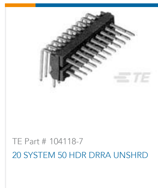
TE Part # 104118-7 20 SYSTEM 50 HDR DRRA UNSHRD