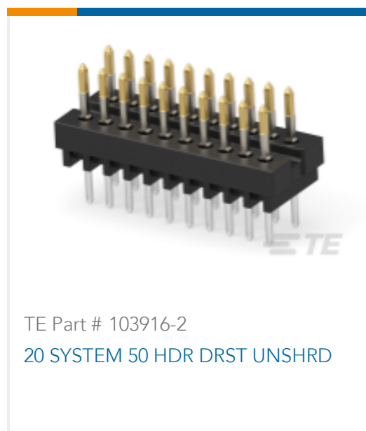
TE Part # 103916-2 20 SYSTEM 50 HDR DRST UNSHRD