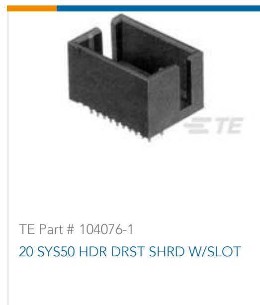
TE Part # 104076-1 20 SYS50 HDR DRST SHRD W/SLOT